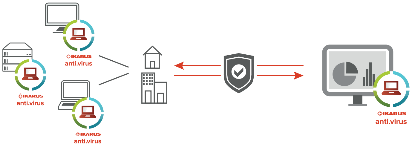
Fig. 1: IKARUS anti.virus in the cloud protects laptops, desktops and servers from harmful programs and unwanted intruders. The software can be controlled directly on the device or via a web interface.

Communication over the internet is secured, regardless of the location of the managed devices. IKARUS anti.virus in the cloud is multi-tenant capable and fully scalable. You benefit from easy administration of all managed licences and devices with a single login, no matter the scale. Management incurs no additional licence fees or costs for installation, updates or maintenance.